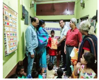
At ROTA School Alambazar on 29.09.2022