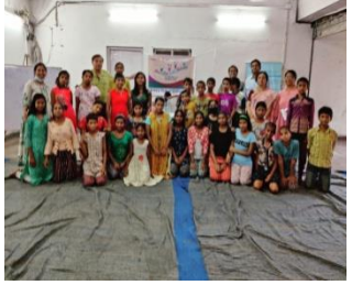
Some members at Project at SOS Village, Salt Lake on 24.09.2022.