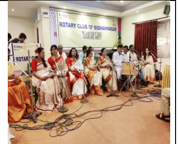
At Agamani Program on 28.09.2022