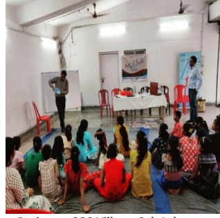
Project at SOS Village, Salt Lake on 24.09.2022