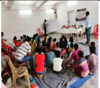
Project at SOS Village, Salt Lake on 24.09.2022