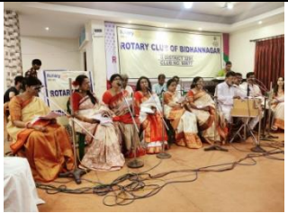
The participants at Agamoni Program on 28.09.2022