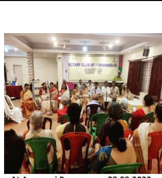
At Agamoni Program on 28.09.2022