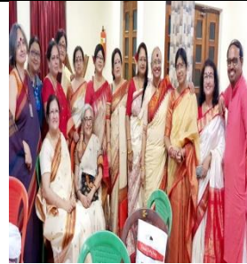
Ladies member and spouse after the AGAMANI program on 28.09.2022