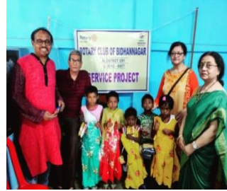
Distribution of New Clothes before Puja festival at BBD School- Muraripukur on 25.09.2022