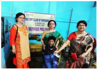
Distribution of New Clothes before Puja festival at BBD School- Muraripukur on 25.09.2022