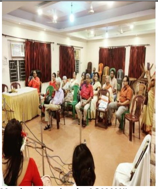
Members listening the AGAMANI program on 28.09.2022