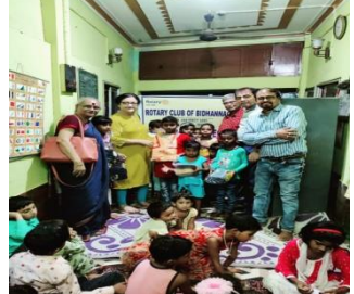
At ROTA School Alambazar on 29.09.2022