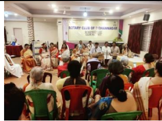
At Agamoni program on 28.09.2022