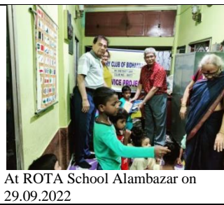
At ROTA School Alambazar on 29.09.2022