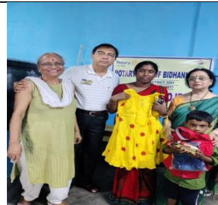
Distribution of New Clothes before Puja festival at BBD School- Muraripukur on 25.09.2022